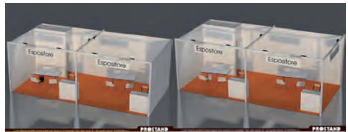
1 OPEN FRONT SIZE 4X4